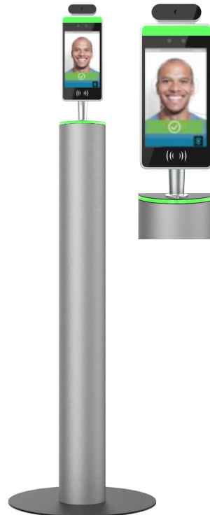
Pedestal w/ LED