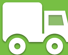
STAGING + DEPLOYMENT