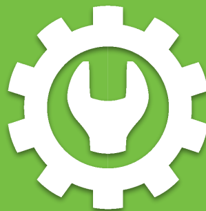
ASSEMBLY + INTEGRATION